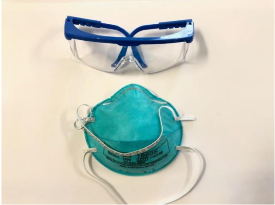
N95 with Goggles