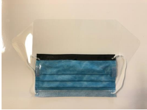
Procedure Mask with Attached Visor