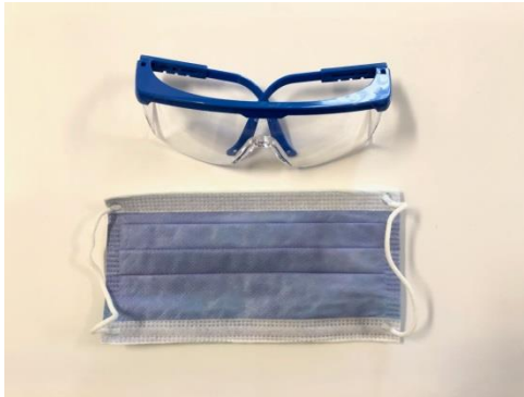
Procedure Mask with Goggles