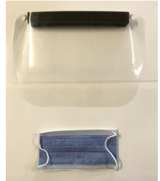
Procedure Mask with Face Shield